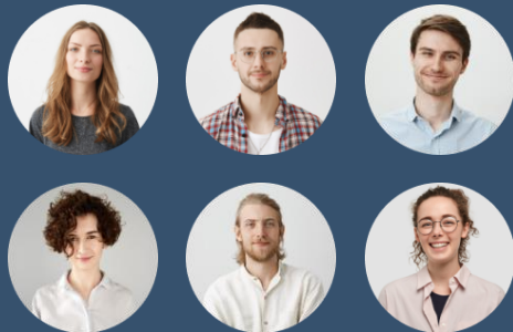
Trusted Referral Agents

Broker (MLO) Leads: Pay 50BP to 200BP at closing (we keep a piece from brokers).